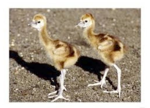
Black Crowned Cranes one week old.

Crowned Cranes use both wet and dry open habitats, but prefer freshwater marshes, wetter grasslands, and the edges of water bodies. The West African subspecies prefers a mixture of shallow wetlands and grasslands, especially flooded lowlands in the sub-Sahelian savannahs during the rainy season (generally June-September). They also forage and nest along river banks, in rice and wet crop fields, and even in abandoned fields and other dry lands, although always close to wetlands. In the eastern portion of its range, the Crowned Crane typically inhabits larger freshwater marshes, wet meadows and fields, and open areas of emergent vegetation along the margins of ponds, lakes, and rivers. These landscapes often include acacias and other trees, in which the cranes will roost.